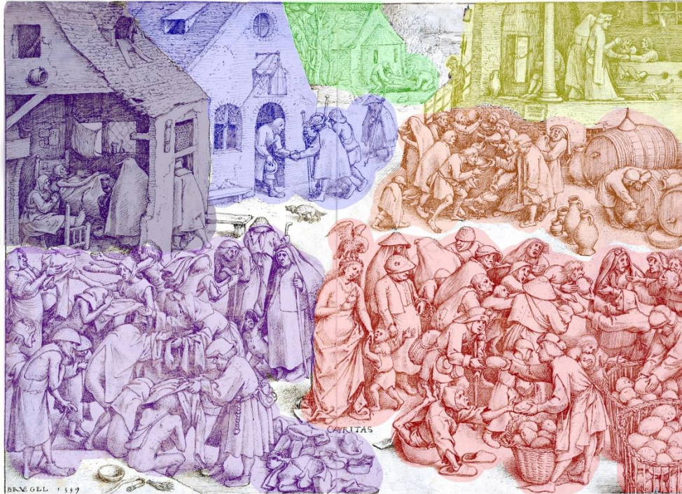
Caritas, The Seven Acts of Mercy, by Pieter Bruegel the Elder (1559). Counter-clockwise from lower right: feed the hungry, give drink to the thirsty, visiting the imprisoned (or ransom the captive), bury the dead, shelter the stranger, comfort the sick, and clothe the naked.

Scriptural references to meeting the bodily needs of others: